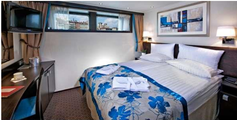
PHOTO SHOWN IS REPRESENTATIVE OF A STATEROOM IN THE CATEGORY

Avalon Deluxe Stateroom (Cat. D, E) - 172 sq. ft.