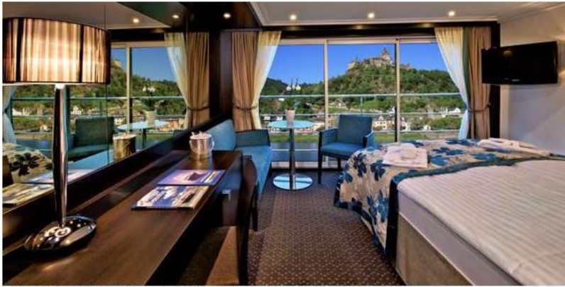
PHOTO SHOWN IS REPRESENTATIVE OF A STATEROOM IN THE CATEGORY