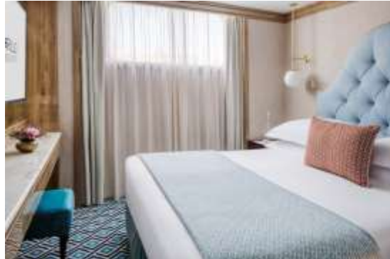
Deluxe (156 sq ft - 14.5 sq m)