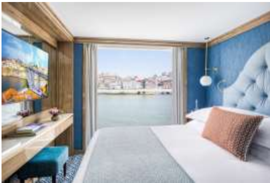
French Balcony (156 sq ft - 14.5 sq m)