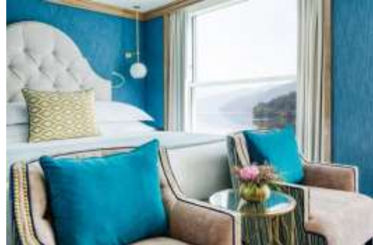
Suite (220 sq ft - 20.4 sq m)