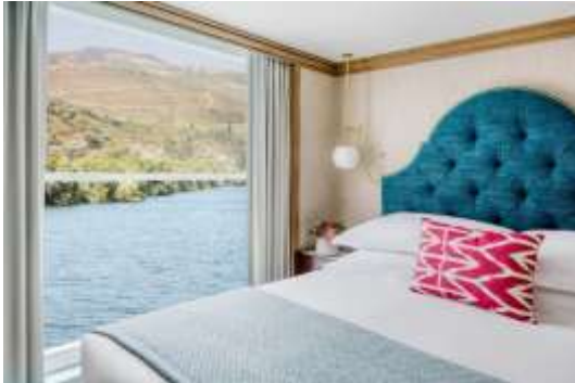
Grand Suite (307 sq ft - 28.5 sq m)